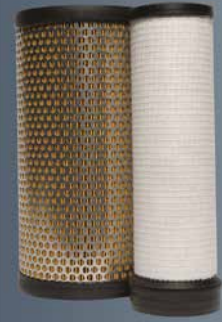
Toyota Outer Air Filter