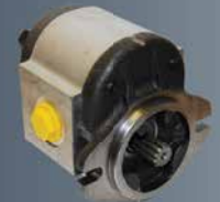
Hydrostatic Charge Pump