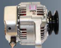
Alternator 4Y Engine