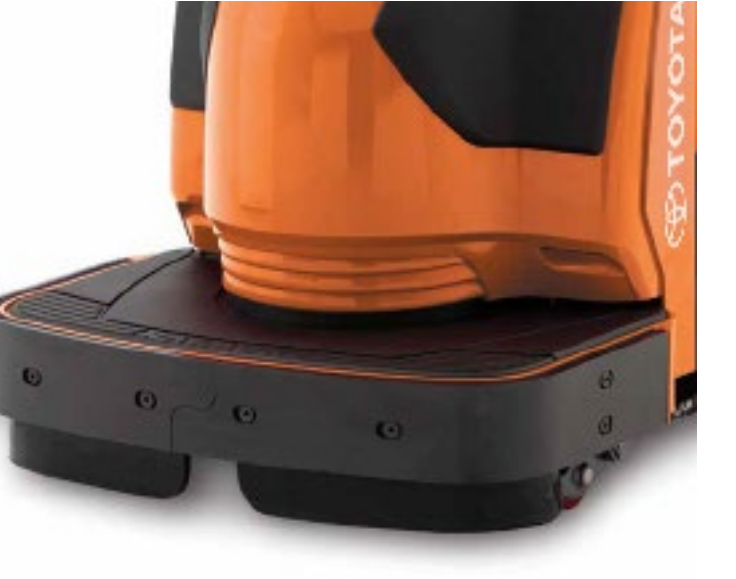
Heavy-duty, optimal bumper guard features 13 mm steel wrapped around a 13 mm rubber core to further absorb and diffuse impacts from the frame and components.

Heavy-duty ductile iron undercarriage components provide greater flexibility and improved wear