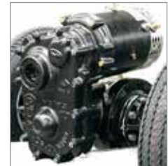
GT Automotive Drive