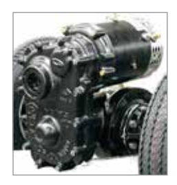
GT Automotive Drive