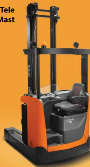
Duplex Tele Mast